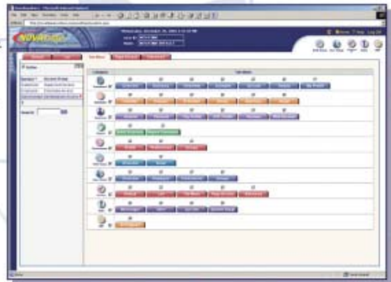
Provides an easy and intuitive interface for your administrator to maintain access rights.

NOVAtimeAnywhere Information at your fingertips Anytime - Anywhere