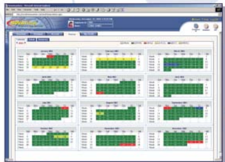
Timesheet History delivers an easy and intuitive interface that empowers employees to view past attendance.

Employee Web Services Offline Module offers a great tool for mobile employees who do not have wireless connections. It also allows employees to punch IN, OUT, and Transfer when NOVAtimeAnywhere® connection is not available. This is ideal for cases where the IIS server or the Internet / Intranet connection is unavailable for any reason.