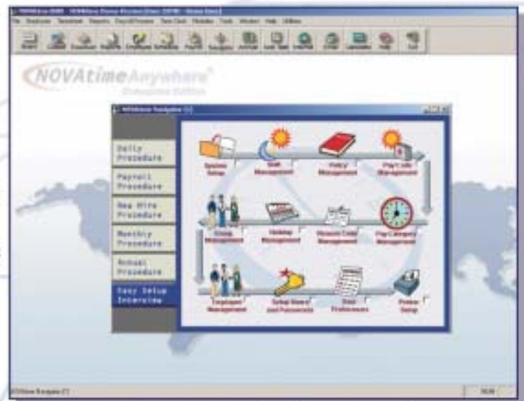
Intuitive Navigator guides users through the most common tasks.