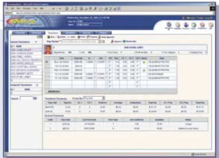
Timesheet Editor provides an intuitive spreadsheet-like interface for supervisors to review and edit timesheets.